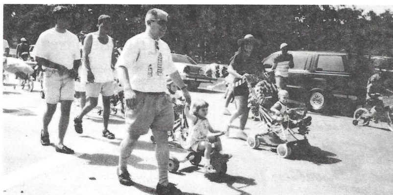
Parents also got into the red, white and blue spirit as they accompany their children in the Third Annual Garden Oaks 4th of July Bicycle Parade.

This volunteer activity takes only a little time each month. And it's good exercise!