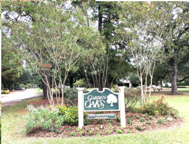
Rose Garden Entrance