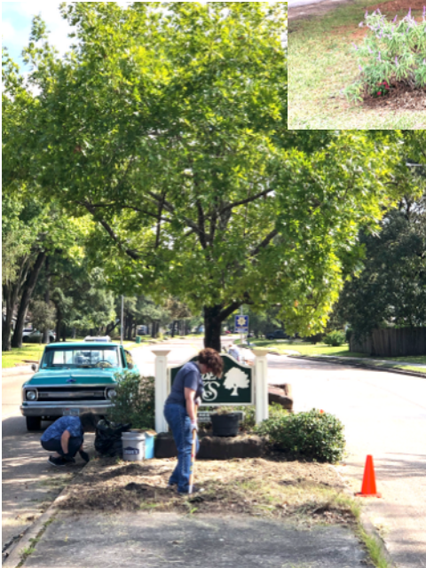
W 43rd & Apollo Esplanade