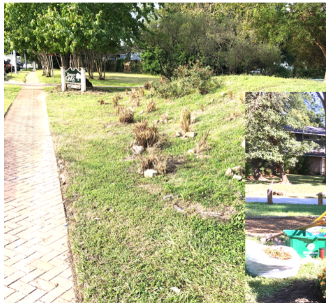
← Berm Garden Oaks Blvd ↓

As we go to print, the Beautification activity reached peak for the year. In the first half of October, both the Berm (W 30th & Durham) and Garden Oaks Boulevard Esplanade are showing the results of very productive work days. Volunteers from all over Garden Oaks and Shepherd Forest turned out. Special thanks to the Garden Club who shifted their Friendship Park work day over to Garden Oaks Boulevard.