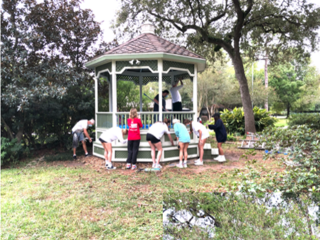
Girl Scout Gold Award Project at Gazebo Park