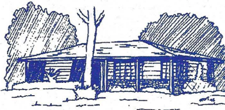
863 W. 41st