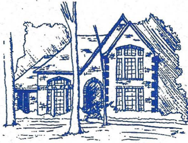
523 W. 33rd

As the countdown to Garden Oaks' annual home tour date draws near — Sunday, October 18, from noon until 6 p.m.—it seems appropriate to announce which homeowners have agreed to open up their doors to all of us.