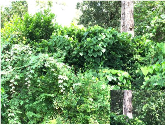
Gazebo park Workday