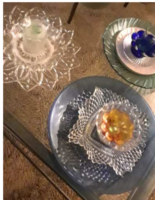
Glass flowers assembled during the Garden Club Crafts Day in October.