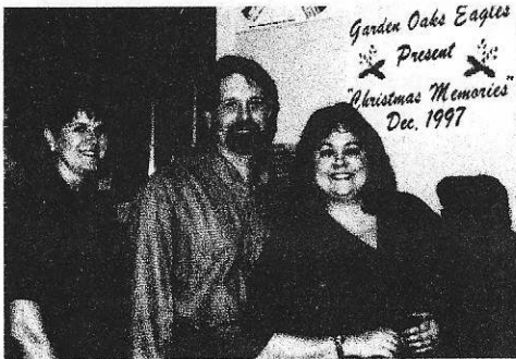
Waiting in a buffet line is so much more fun with friends!