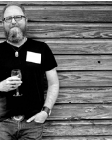
Wine Walk