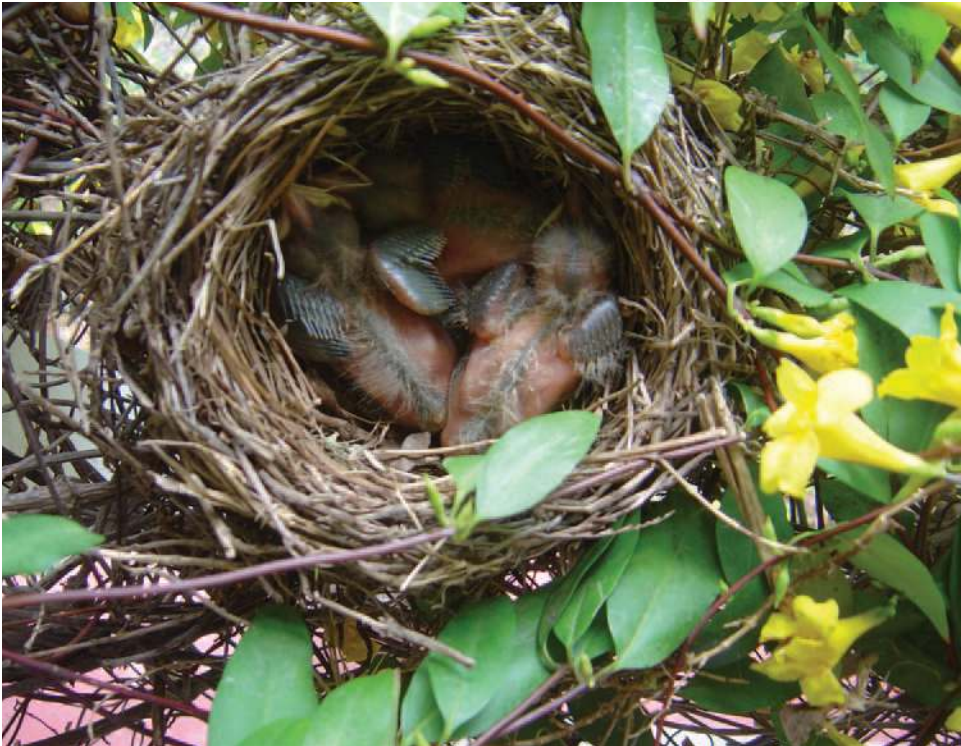
The three perfect eggs hatched into three very hungry chicks. For two weeks the Jarvis family watched as mom and dad robin worked diligently to feed these swiftly growing chicks. They were so dedicated to their task that they would fly, bugs and worms in beaks, right over our heads as we sat on the porch and watched them grow. While they have long since left the experience continues to bring a smile.

BACK OR NECK PAIN? HEADACHES? EXTREMITY PAIN? There's a new doctor in town.