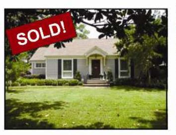
816 W 32nd