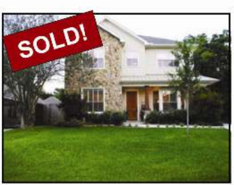
983 W 42nd