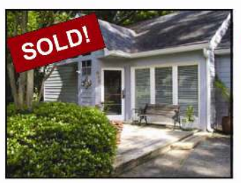
815 W 41st