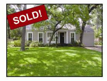
705 W 41st