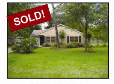
1038 W 41st