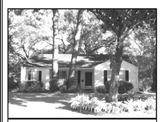
810 W 31st St. 3-3-2 remodeled, huge lot $300,000s