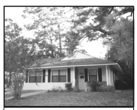
906 West 43rd St. 2-1-2 $40k recent upgrades $180,000s