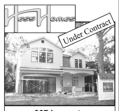
907 Lamonte 4-3-2 NEW CONSTRUCTION $600.000s

(We have other projects, call for details)