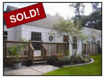
842 W 41st