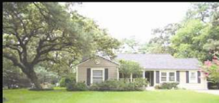
757 Sue Barnett