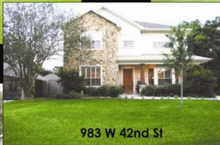
983 W 42nd St