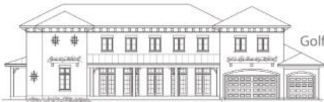
Golf / Althea